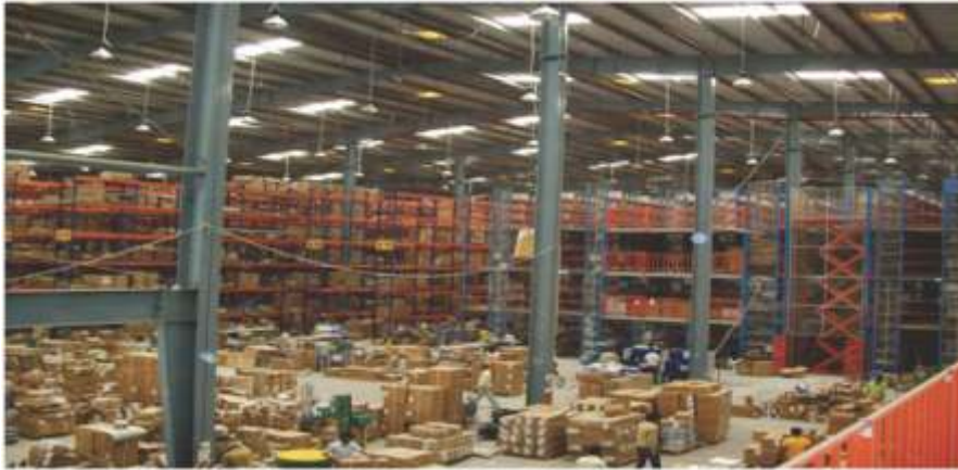
3PL Warehouse, Palwal, Faridabad

Provided consultancy and advisory services for execution and completion of one of the biggest 3PL warehouse in North India.