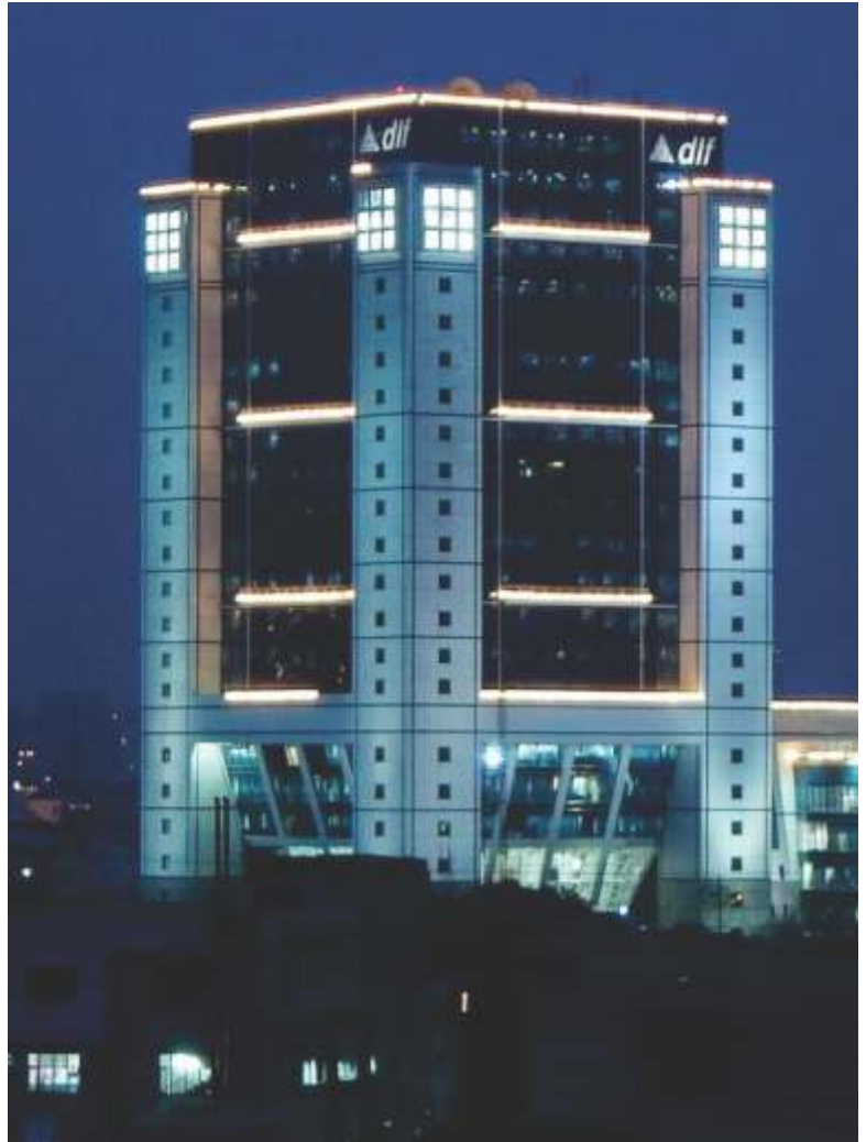
DLF Limited, PAN India

A detailed study was conducted for marketability and valuation of assets owned by the company across the country.