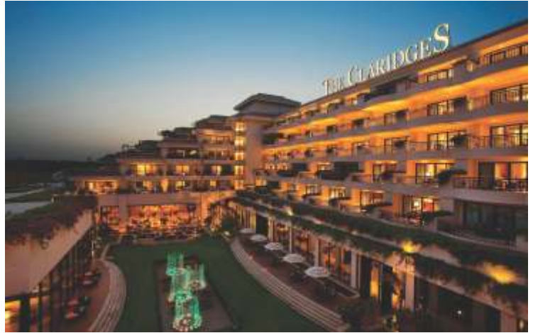
Hotel Claridges, Surajkund, New Delhi

ABN Amro Axis Bank Allahabad Bank Andhra Bank Bank of Maharashtra Canara Bank Citibank Central Bank of India Dena Bank DBS HSBC Indian Overseas Bank Karnataka Bank Oriental Bank of Commerce Punjab National Bank Punjab & Sind Bank State Bank of India State Bank of Patiala State Bank of Bikaner & Jaipur State Bank of Travancore Syndicate Bank Union Bank of India