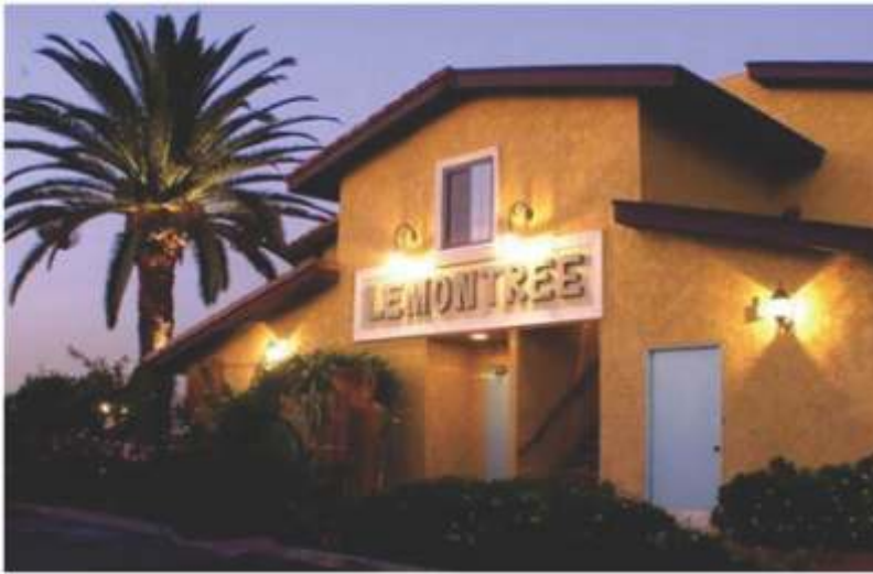
Lemon Tree Hotels, PAN India, Locations

A detailed study was undertaken for business valuation and asset valuation of the group