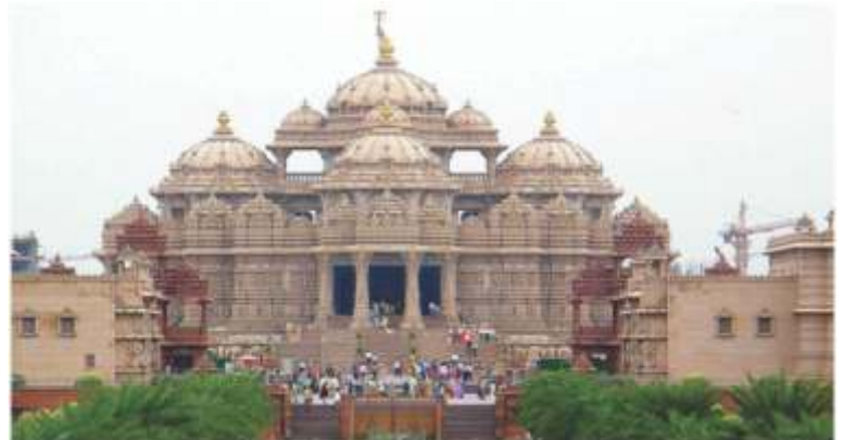
Akshardham Temple, New Delhi

A detailed study was conducted for marketability and estimation of the market value of The Claridges Hotel